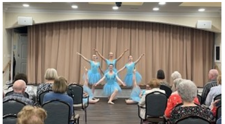
Middle Georgia Youth Ballet showcased pieces of their Spring performance at Carlyle Place