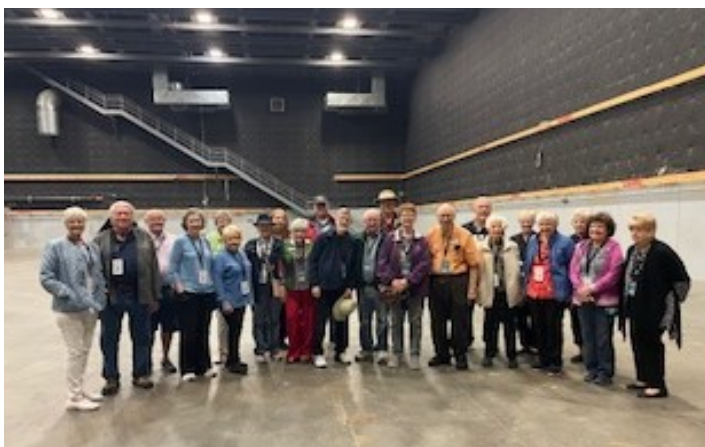
Residents in a Studio Room at Trilith Studios