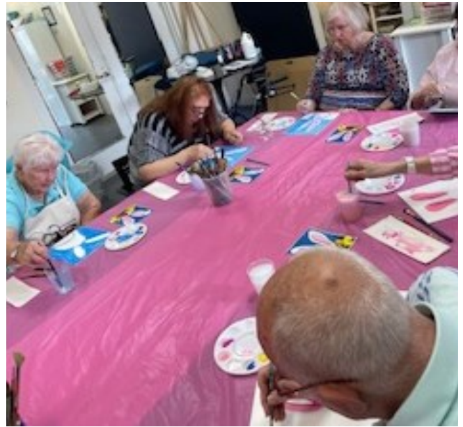
Residents painting bunny ears just in time for Easter