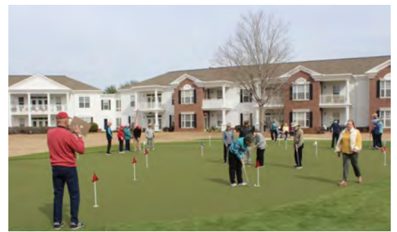
Residents on the new Putting Green

Send your picture to Elizabeth.fletcher@atriumhealth.org or Celeste.minschew@atriumhealth.org.