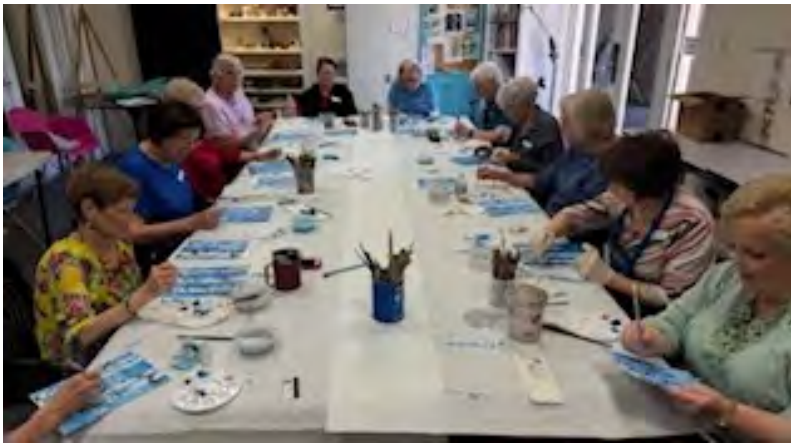
Residents painting winter birches in the Winter Painting Class