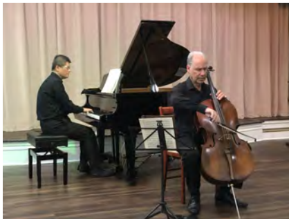
Beaux Arts Duo performed in February