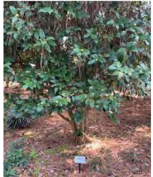
This camellia at Masee Lane Gardens is named after Muriel Nathan