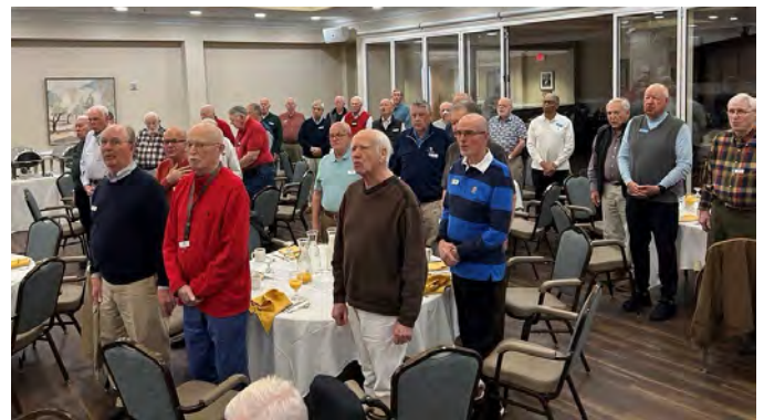
BUMs Breakfast attendees pledge to the flag