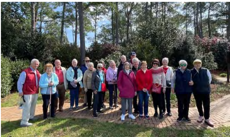
Residents at Masee Lane Gardens in Fort Valley, GA