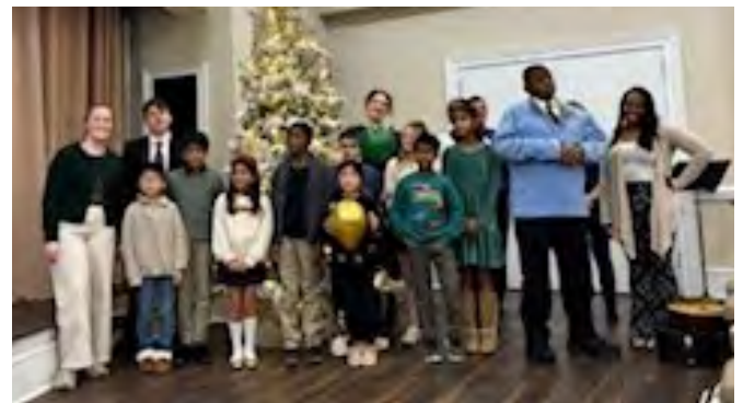
Young Americas School of Music students at their Christmas performance