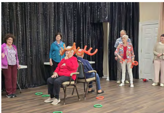
Residents participating in the Christmas Games