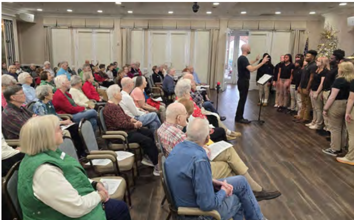
Residents attending the Washington County Song & Dance performance