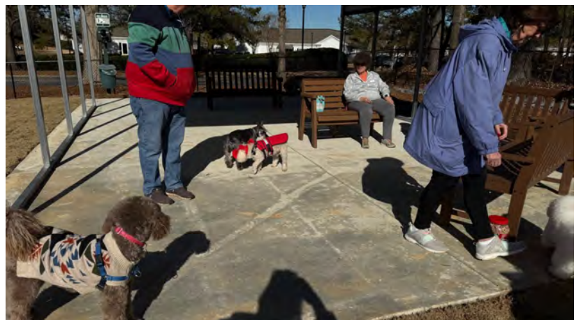
Residents and their pups enjoying the new and improved dog park