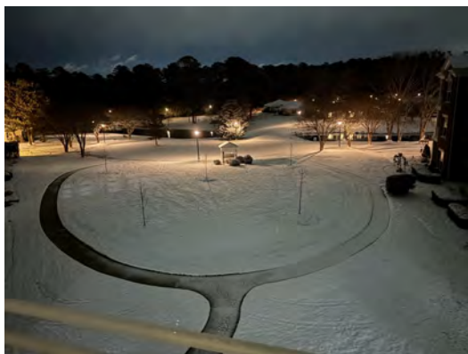
Calm and cold night outside the East Wing