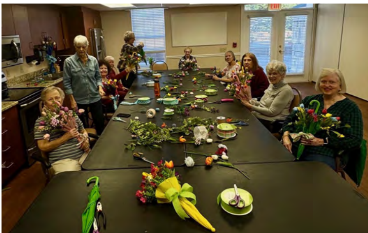
January's craft class: creating decorative umbrellas