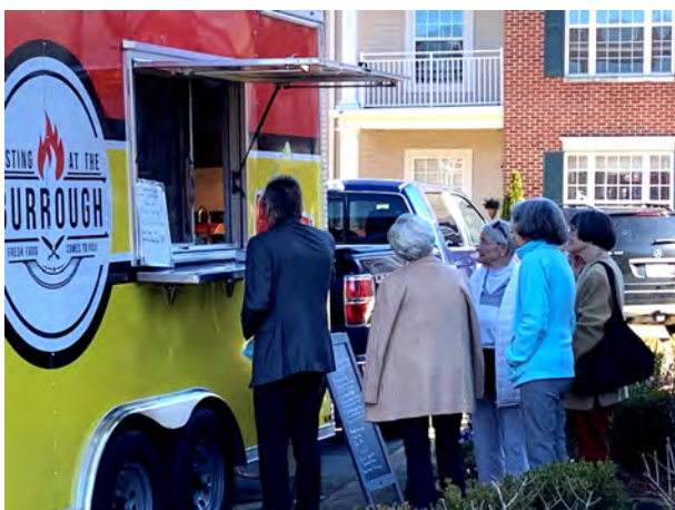
Residents in line - Tasting at the Burrough Food Truck