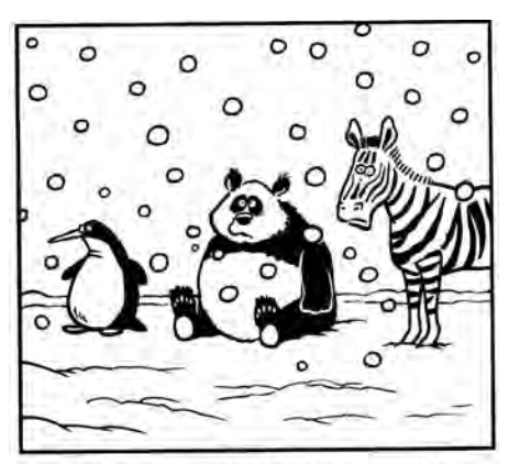
Colouring picture for lazy people.