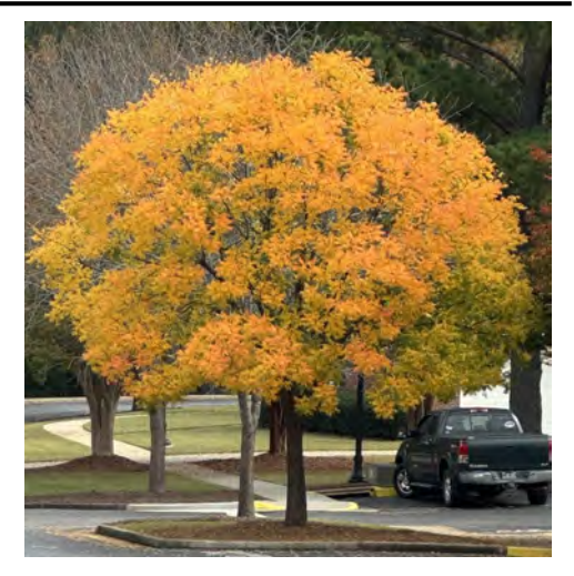
Beautiful fall leaves on Carlyle Place grounds submitted by Holly Ertel

Dementia Support Group Thurs., December 26 · Activity Rm A · 1:30 pm