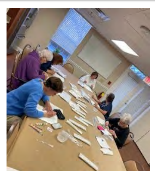
November's Paint by Numbers class

November's crafters creating fall door décor