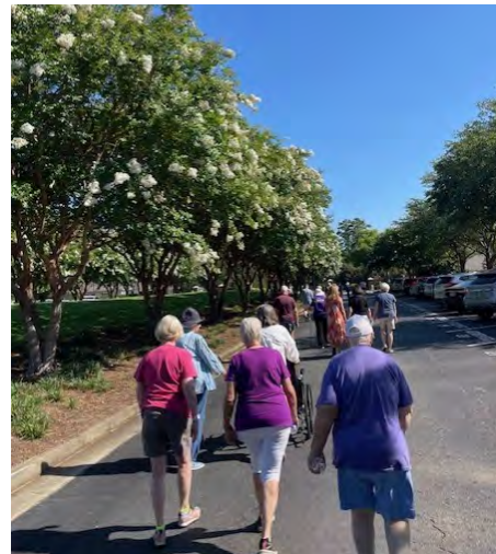
Residents walking around the Berm