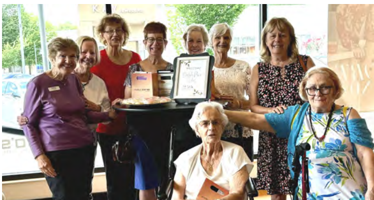
Residents shopping at Chico's in the Rivercrossing Shopping Center