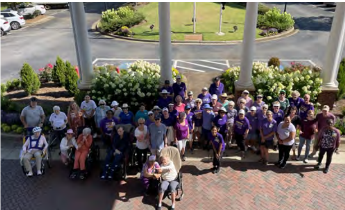
Residents prepared to walk in support of the Alzheimer's Association