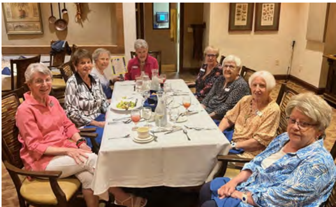
Ladies, all from Sun City, enjoying dinner together.