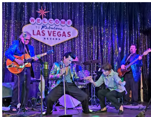
Kathy Marbut doing the Twist with Elvis

Unless otherwise noted, sign ups for indicated activities will be through your Uniguest App