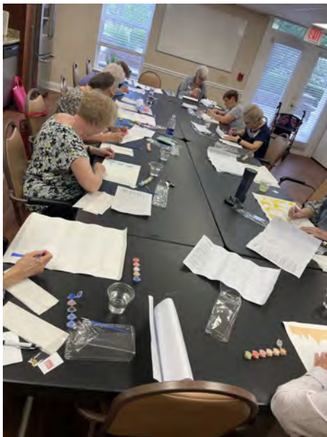
Residents hard at work on their Paint by Numbers project in Craft Class