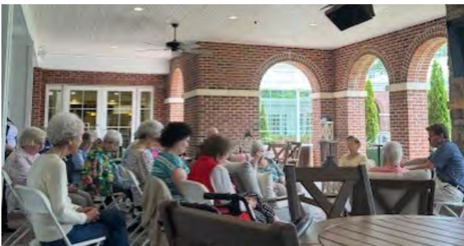
Residents at the National Day of Prayer gathering