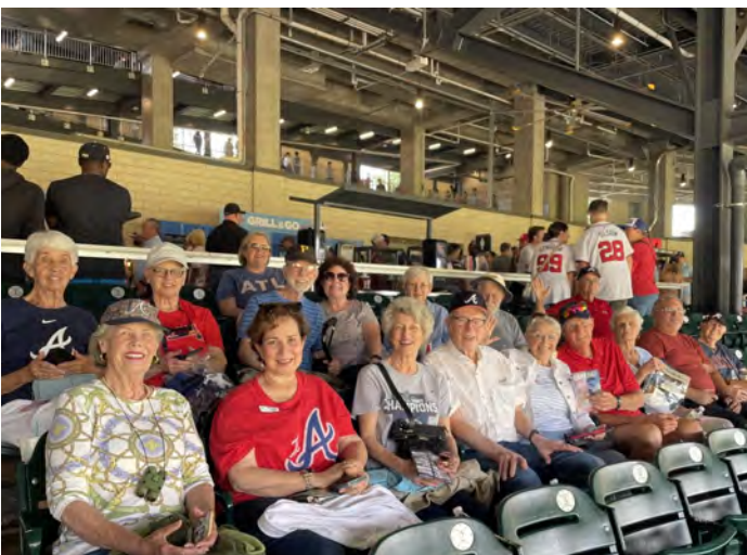
Residents at the Atlanta Braves vs the San Diego Padres game