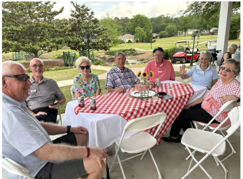
Residents enjoying fellowship at the Pig Pickin' Party