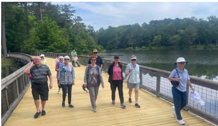
Residents enjoying a stroll across the lake at Callaway Gardens

Spend a summer morning enjoying breakfast and fellowship admiring the Butterfly Garden in all of its glory! This event will be held on the patio at the pickleball court.