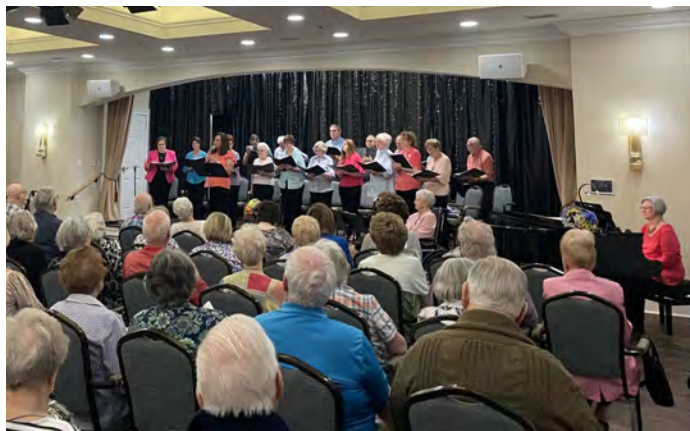
The Carlyle Choristers performing at their Spring Concert