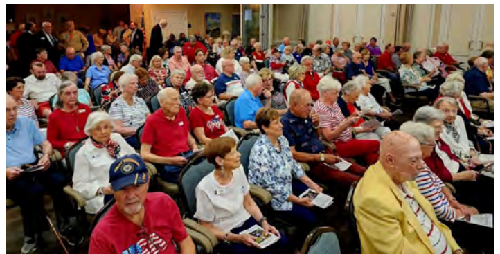
Residents participate in the annual Memorial Day Program

Friday, June 28 • Seasons Dining Rm • 12:00 pm