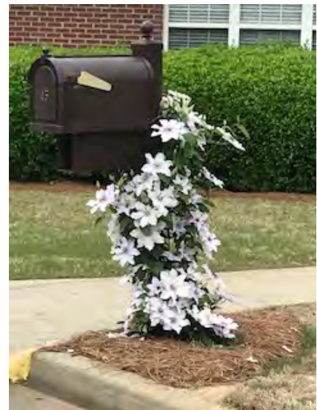
Bob & Bonnie Hearn's mailbox covered in Clematis

Unless otherwise noted, sign ups for indicated activities will be through your Uniguest App.