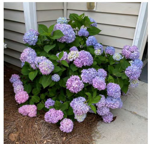
Beautiful hydrangea at the Nables