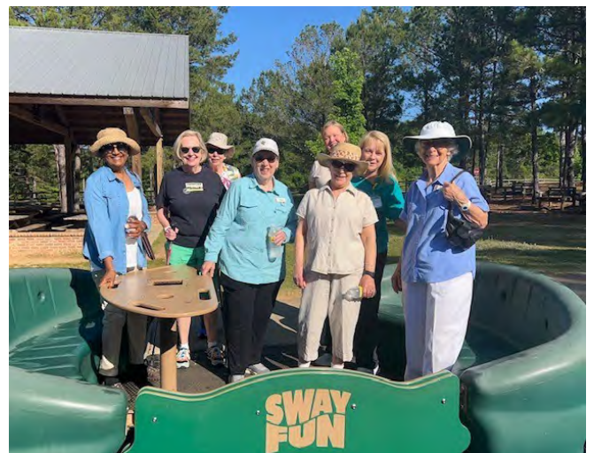
Residents visiting the Butterfly Garden at Amerson Park