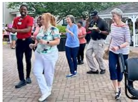
Residents line dancing at the Pig Pickin' Party