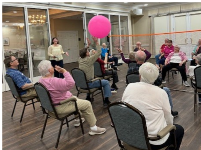
Residents playing chair volleyball