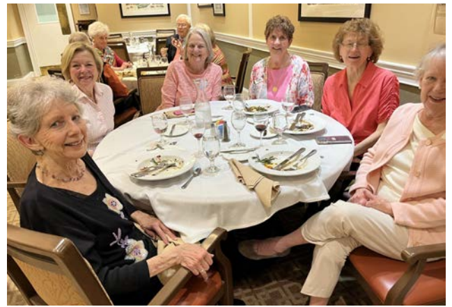
Ladies in pink enjoying the Cherry Blossom Dinner