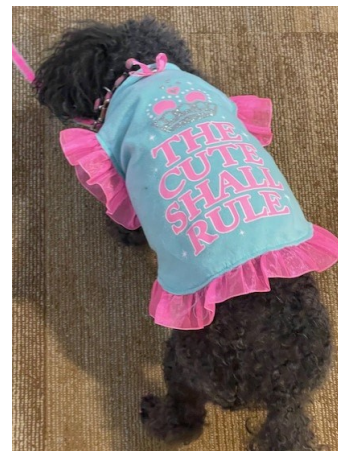
Gabby Degelmann, dressed to impress