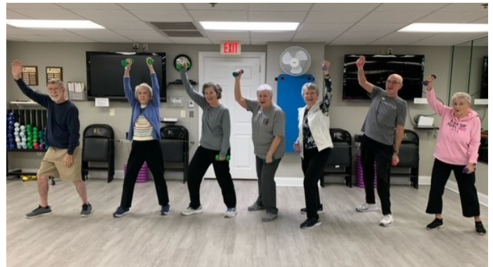
Residents posing at Low Go Cardio class