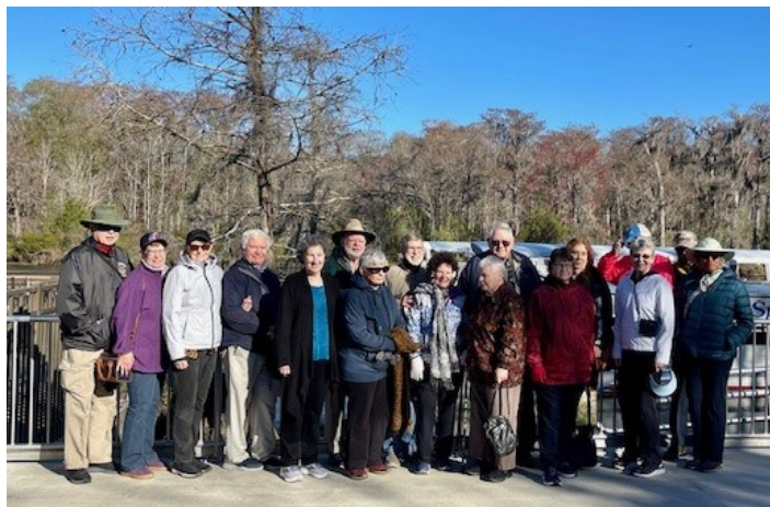
Residents in Wakulla Springs, Florida