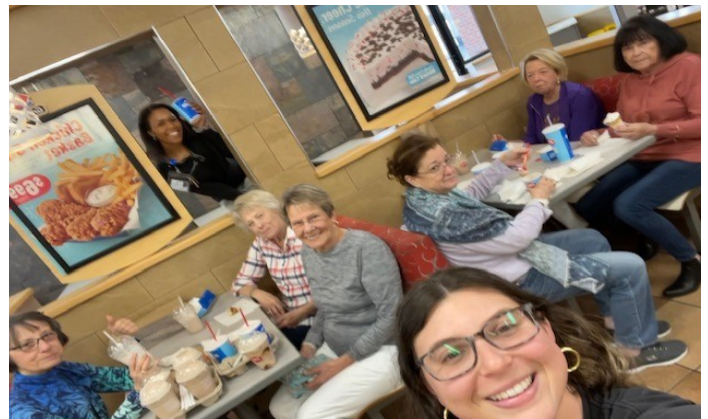
Residents & staff enjoyed a trip to Dairy Queen